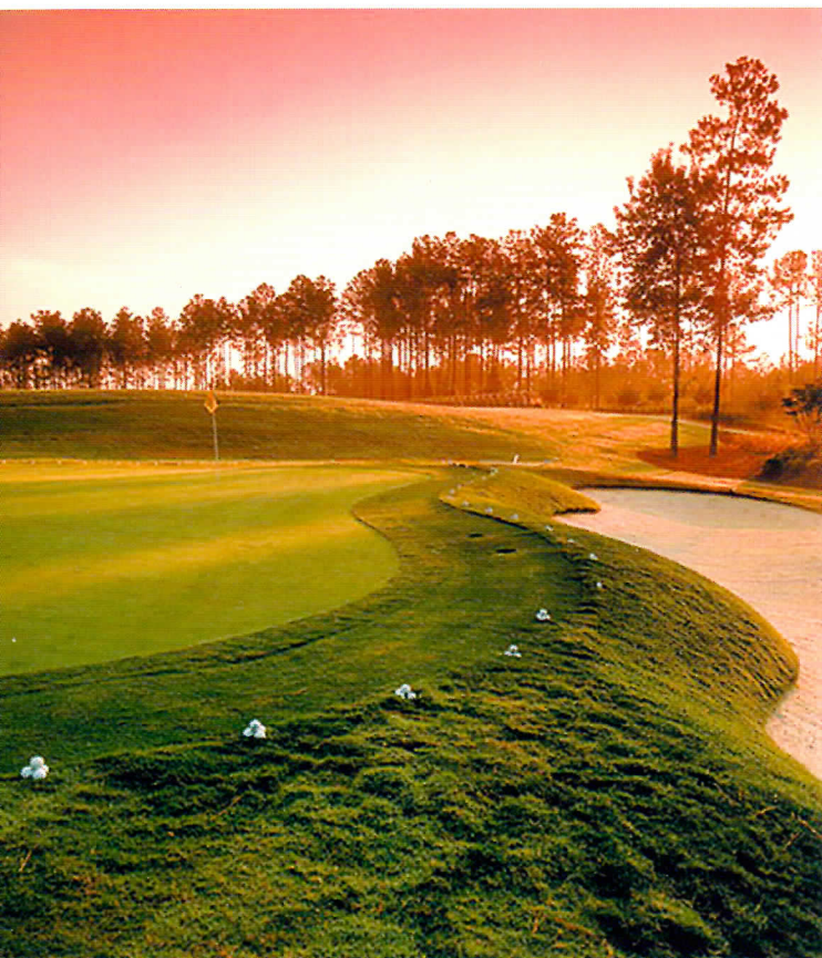
Left: The sun rises over the Oconee course at Reynolds Plantation in Greensboro, GA Right: Rees Jones