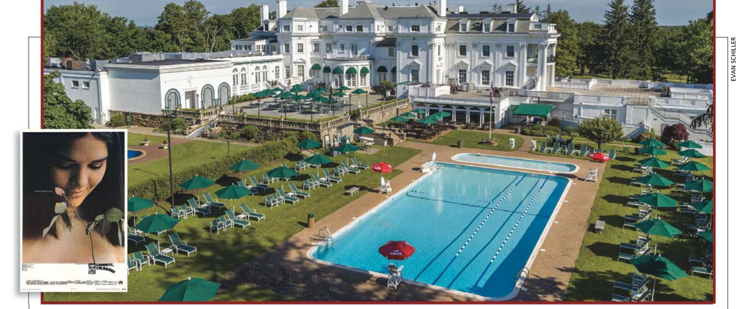
Above: The expansive pool was used in the filming of Goodbye, Columbus starring Ali McGraw ( inset ) and based on the Philip Roth novella. Below: The formal gardens in 1926.

"The new one is much more traditional in a Tillinghast sort of way. It's back-to-front with subtle breaks. The green is now kidneyshaped and has a bunker right front that matches the rest of the golf course."