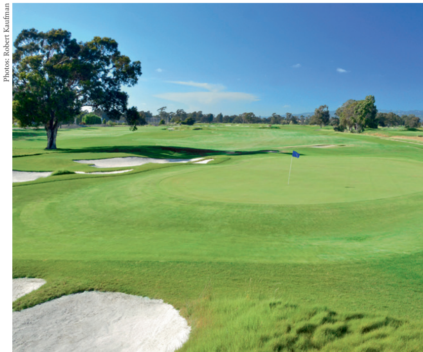
Left, the par-four fourth hole at the new Corica Park South Course and, below, the par-five sixth

The new cart paths are set slightly below ground level to help collect runoff water – the course has a comprehensive water harvesting system, to ensure that none of the irrigation put on it goes to waste, essential in a high cost water environment like California – and have been constructed using recycled glass and AB base rock. Logan says: “This is the future of golf. It is the only way golf will survive, building courses that blend into the environment and use less resources.”